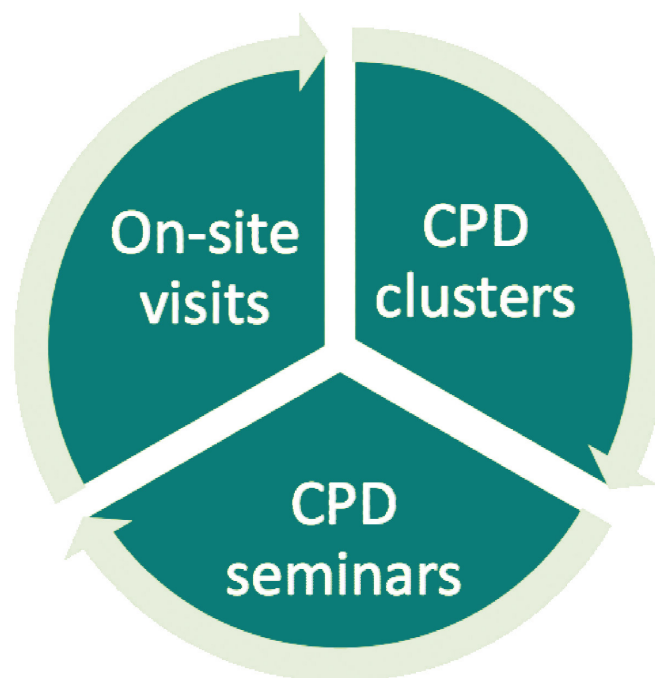
Figure 2: Elements of the mentoring model

Each of the three elements in the mentoring model as shown in Figure 2 is explained in detail below.